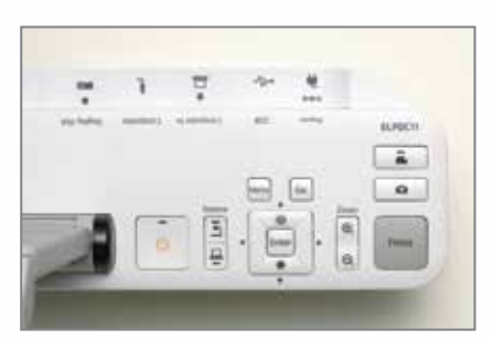
Intuitive buttons and icons