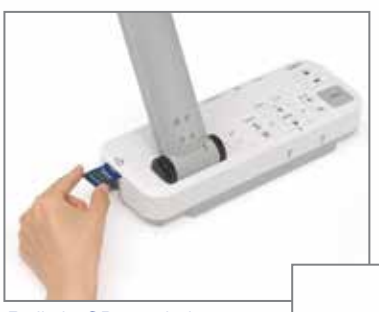
Built-in SD card slot