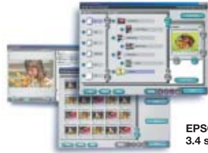
EPSON PhotoQuicker 3.4 software