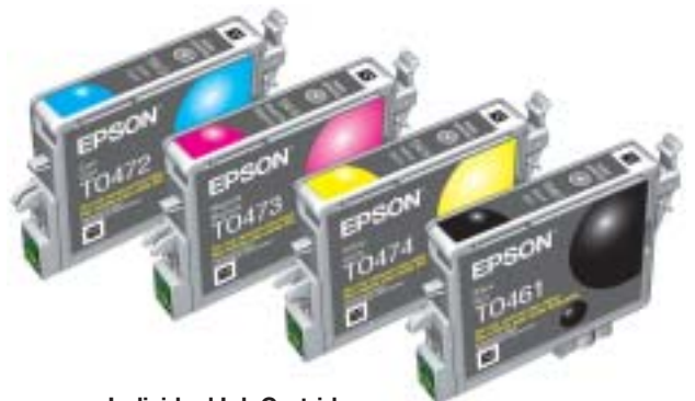
Individual Ink Cartridges

With parallel and USB connectivity for full Windows and Macintosh compatibility and a 120 page auto sheet feeder for large print runs, the STYLUS C83 has the versatility to deal with almost any job at any time and in any environment.