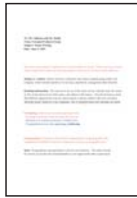
★2 Colour Text (MEMO) A4