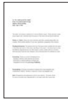
★1 Black Text (MEMO) A4

Print Speed Data Printout Patterns The thumbnail images below show the printout patterns used to determine print speed specifications.