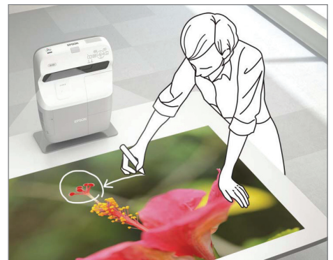
Project onto any horizontal surface such as a tabletop