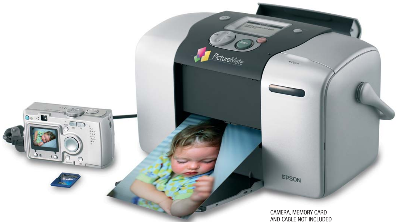
CAMERA, MEMORY CARD AND CABLE NOT INCLUDED

EPSON makes creating photos from your digital camera simple, cost effective and convenient. With the EPSON PictureMate, creating lab-quality and highly durable photos has never been easier.