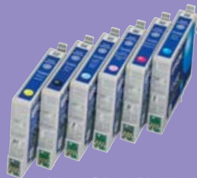
Advance 6 Colour Intellidge Ink

The Epson STYLUS PHOTO RX650's use of individual Epson Intellidge Ink cartridges, each with high performance dye-based ink, plays a major part in the printer's beautiful and long-lasting photo printing capabilities. Embedded within each of the Epson STYLUS PHOTO RX650's six ink cartridges is an Epson Intellidge chip, designed specifically to work with the software driver to provide you with accurate, on-screen ink level status information. You can even remove and replace partially empty cartridges in preparation for big print jobs, then swap them back for smaller jobs – all without losing track of ink usage and levels.