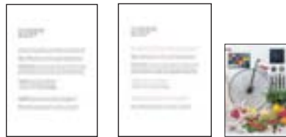
★ 1 Black Text (MEMO) A4 ★ 2 Colour Text (MEMO) A4 ★ 3 Photo 4" x 6" (borderless)

Print Speed Data Printout Patterns The thumbnail images below show the printout patterns used to determine print speed specifications.