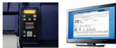
The printer can be managed through the Control panel or via Epson Control Dashboard s/w complete with e-mail status & error notifications