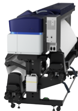
The Ad-ATC and ATU enable roll-to-roll production with superior linearity, parallelism, and tension for off-line processing and tiling applications