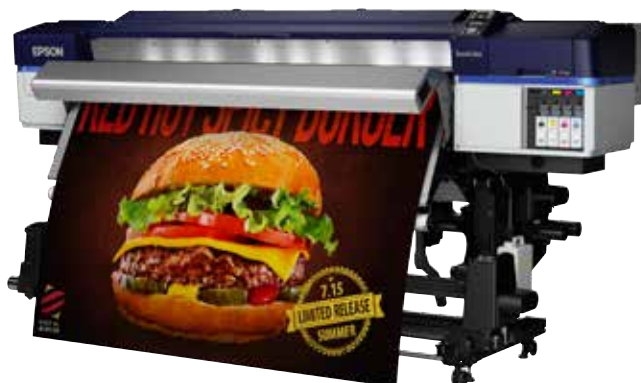
An optional Print Drying System integrates with the printer to enable production at high speed and with heavy ink loads

1 Figures are maximum engine speeds only. They do not include provisions for image processing, transfer, drying or post production. Nominated speeds may not be suitable for all media types and/or applications. Alternate print modes may be employed by RIP s/w for different results.