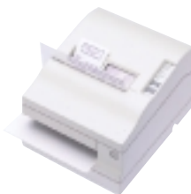
1.5 Station Printer TM-U950

Using the EPSON OCX Driver for the TM-U950 will allow you to reduce time and money spent on developing POS application software.