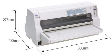
DOT MATRIX DLQ-3500 WEIGHT: Approx. 18.1 Kg