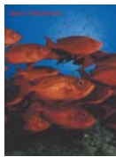
With Epson DURABrite™ Ultra Ink