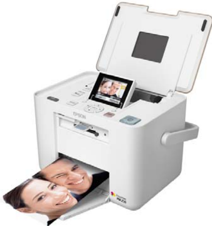
Epson PictureMate 250