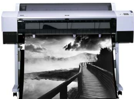
Epson Stylus Pro 9800