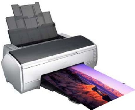
Epson Stylus Photo R2400