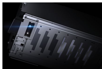
Advanced media set-up with automatic self-adjustment