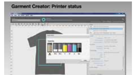
Supplied with Epson Garment Creator S/W for Macintosh® & Windows®