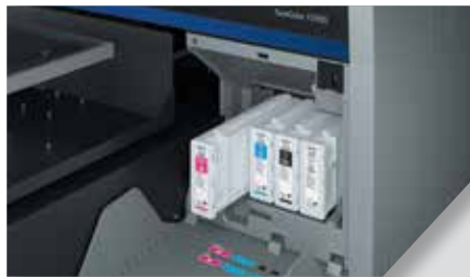
Low maintenance design with improved self-cleaning print head and new auto cap washing system