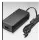
PS-170 Power Supply Unit