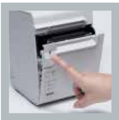
Pull the lever, and open the door until it is fully open.