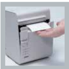
Close the door. The paper is fed automatically.