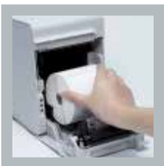
Insert the paper roll.