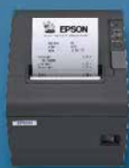
Thermal Receipt Printers