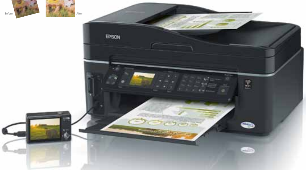
Step 3 Print